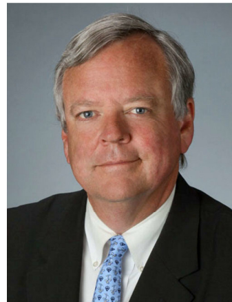
Robert R. McNamara